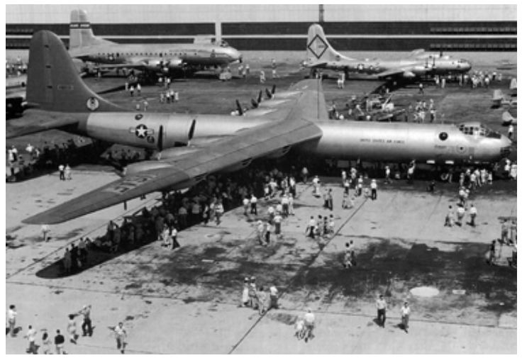
A B-36 at the 1949 National Air Fair in Chicago.

No official name; "Peacemaker," often used, was unofficial ★ first US thermonuclear weapon delivery system ★ took part in six live nuclear weapon tests ★ featured in 1955 film "Strategic Air Command," starring Jimmy Stewart ★ used to test feasibility of atomic-powered aircraft ★ initial tires 9 feet tall, with enough rubber for 60 car tires ★ 32 lost in accidents ★ one-third builit as or converted to RB-36 reconnaissance models ★ suffered two "Broken Arrow" incidents, one in Canada and one in New Mexico.